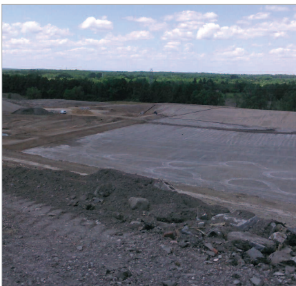
Cell 15, looking to the northwest

excavation. The monitoring panel for Cell 2 and Cell 15 leachate will both be located on the northeast side of Cell 15 for ease in access and maintenance.