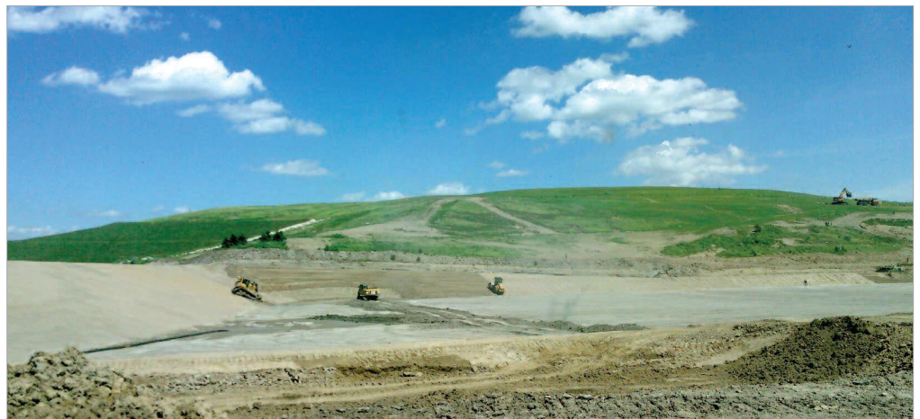
New Cell 15, facing east